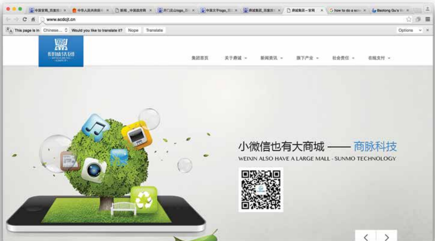
Figure 14. Logo on top left of this website for Dingcheng Group plays on the Chinese character ding in its design.

Chinese seal carvings, Terracotta warriors, a Chinese knot, Qin bricks and tiles, Peking opera face masks, Chinese lacquer, red lanterns, dancing lions, oracle bone inscriptions, books with a vertical layout, a Chinese teapot, Chinese porcelain, or Chinese painting. The list is endless. Incorporating such elements into UI design makes things a little intriguing because many of these traditional Chinese culture elements tend to be detail heavy and may often push the design toward the skeuomorphic. A flat design that incorporates such traditional elements, then, poses a special challenge for the designer.