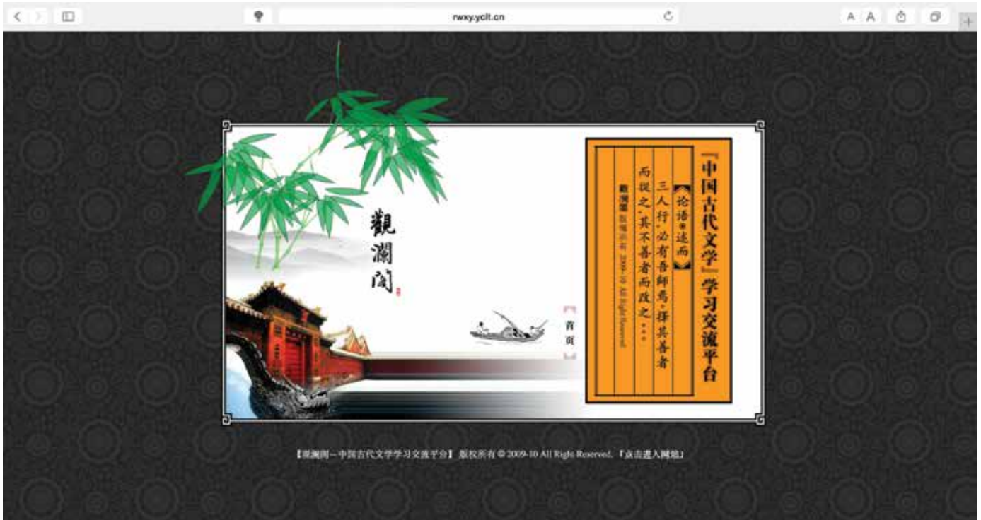
Figure 15. Online platform for studying ancient Chinese literature incorporating uniquely Chinese elements: an ancient Chinese book, an ancient Chinese house, and an old-style boat.