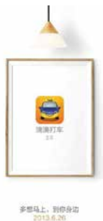
Figure 12. Interface design for Didi Chuxing, the Chinese version of Uber, featuring an integrated design with both skeuomorphic and flat features.