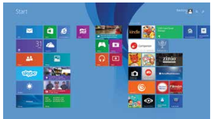
Figure 4. Flat Design: Windows 8 desktop

However, the distinctions between the two approaches go beyond mere visual representations; they reflect philosophical differences in underlying assumptions about human cognitive perception, about effective visual-meaning associations, about cultural contextualizations, and about rhetorical styles, all of which will be discussed later in this article. As Gessler (1998) has defined it, skeuomorphs are “informational attributes of artifacts which [sic] help us find a path through unfamiliar territory” (p. 230). The “unfamiliar territory” in this case refers specifically to the artifacts