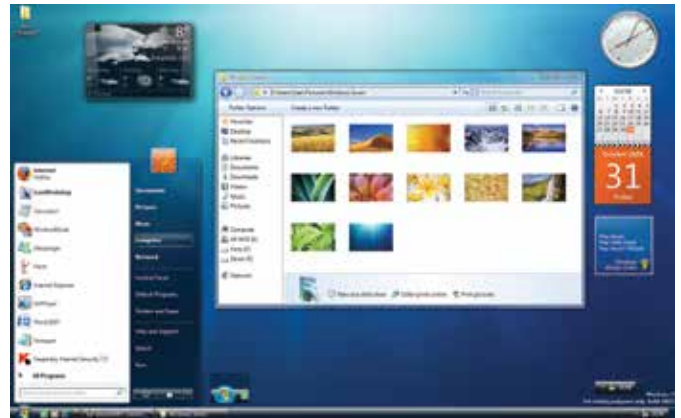
Figure 3. Skeuomorphic design: Windows 7 desktop