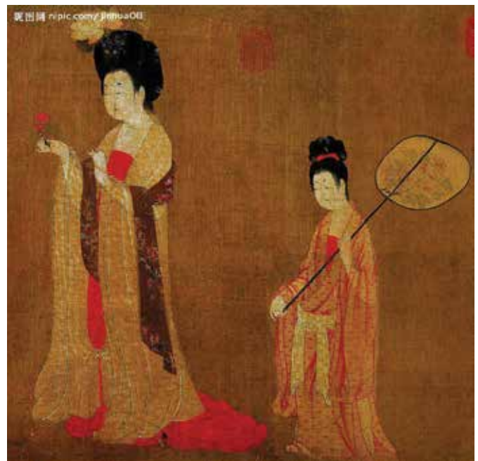
Figure 17. Chinese Gongbi painting as a unique Chinese element is often featured in interface design.

Second, Chinese painting, in a similar fashion, endorses simplicity, which is best represented in its use of symbolism and abstraction. Two kinds of traditional Chinese painting—Chinese gongbi and Chinese landscape—both advocate simplicity. Chinese gongbi painting (see Figure 17), a kind of painting that pays meticulous attention to details, focuses on painting two-dimensional human figures. Although this kind of painting pays close attention to details, its representation of human figures is rather abstract and, often times, does