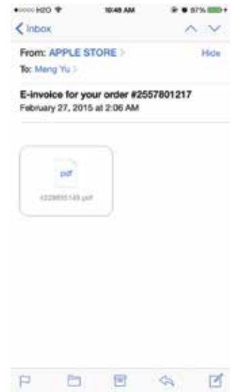
Figure 5. The third icon at the bottom, a folder box intended as the Archive icon in the US, is often misinterpreted as a trash can by Chinese users.

In recent years, the rising concept of responsive Web design has curtailed the wide application of skeuomorphic design (Müller, 2014; Greif, 2013; Asghar, 2014). Responsive Web design is a design model featuring flexible layouts that can adjust the screen size to different devices. With more and more devices connecting to the Internet, designers have focused on creating perfect Web page displays for screens of different sizes in different platforms. Responsive Web design aims at being applicable to all devices and browsers. Some scalable vector graphics (SVGs) are needed under the principle of responsive Web design (Turnbull, 2013). Different from pixel-based graphics, an SVG is a graphic that is comprised of paths, and these paths can form shapes and drawings. By dragging the starting or ending point of the path, the SVG can zoom in and out accordingly without losing the quality of image ("Vector Graphic," n.d.). Designers try to lower the image assets, eschew shadows and textures, and approach a simple design model. It was under these circumstances that flat design emerged and gained favor among designers.