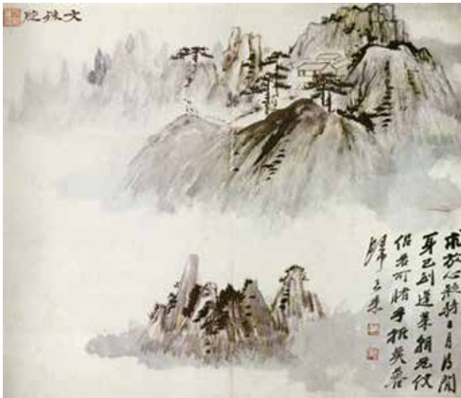
Figure 18. Chinese landscape painting as another unique Chinese element is also featured frequently in interface design.

not concern itself with how accurate the representations are. In a similar way, although with very different forms of representation, the Chinese landscape painting also emphasizes simplicity and abstraction. As shown in Figure 18, landscapes in these paintings are often two-dimensional and abstract, with simple strokes to depict nature in its pure, simple form. Painting has probably exerted the largest influence on designers, as many designers in China started their training in design by learning painting. It's natural, then, that styles in Chinese painting will inevitably influence styles in design.