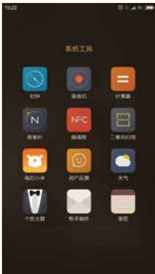
Figure 8. The flat icon design in Chinese apps.

trend. Figure 8 includes samples of typical icon design in China. Although many of the icons have retained the rough shape of the object they represent, the actual visual representation is strictly two-dimensional and abstract. Logo design in China exhibits the same proclivity toward flat design. For example, logos displayed on the portfolio page of a logo design company are all purely flat design 4 . If one company is not representative enough, then a