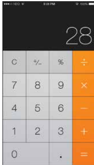
Figure 7. The calculator app in flat design (Apple iOS 8.3).

Flat design also owes its quick popularity to the fact that it stands well to the test of the measuring stick of responsive Web design (Müller, 2014). As we have mentioned earlier, fewer image assets will reduce the response time of loading Web pages, and scalable vector graphics can better accommodate different sizes of the screen. In many ways, flat design fits the purpose of responsive Web design. While flat design is clearly the new fad in the digital design world, the question is: Will it replace skeuomorphism? The answer is not an easy yes or no. A good design takes into consideration both the audience and the purpose of applications. Applications and devices with different purposes and audience groups could certainly accommodate different designs. Clearly, skeuomorphism and flat design are not mutually exclusive. Integration of elements from both designs is not an uncommon practice. Take Apple, for example. Its earlier iOS design was heavily skeuomorphic. It switched to a more flat design in its iOS 8. In so doing, however, Apple didn't totally reject skeuomorphism in its new version of iOS but instead combined elements from both. For instance, as shown in Figure 6, the interface of the weather application in iOS 8 is a combination of flat and skeuomorphic design: On the flat end, the temperature is in plain but very readable numbers, whereas on the skeuomorphic end, the animation of forecast is much more real than the one in the previous version.