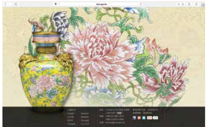
Figure 13. Website of National Palace Museum of Taipei featuring both skeuomorphic and flat designs.

2008 Beijing Olympics 5 , for example, plays on the hieroglyphic character 京, which is the second character in “Beijing” and which also represents a running person. Figure 14 shows a similar play on Chinese characters. In this figure of the website for Dingcheng Group, a science and technology company in China, the logo on the top left of the webpage features, on the top half, a pictographic combination of the two characters 鼎城 (Dingcheng). This pictographic representation is shaped much like what the character 鼎 denotes: a vessel often with a tripod base. Apart from this denotative meaning, the character 鼎 (ding) often carries the connotative sense of a very stable object due to the tripod support base, thus implying stability for a company. This play on the characters in logo design, we believe, has contributed to the move to the flat approach in UI design in China in that Chinese characters themselves are simple and abstract in nature, however hieroglyphic they might be, and their representations, therefore, are inherently simple and abstract as well.