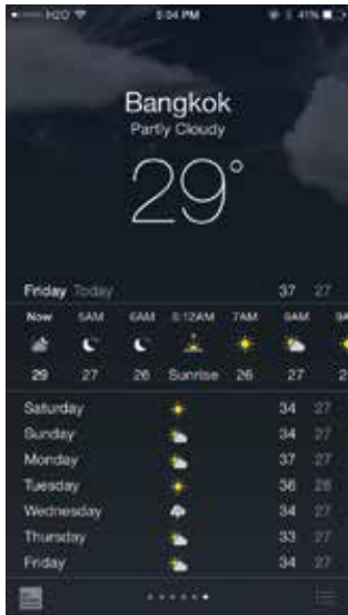
Figure 6. The weather app in flat design (Apple iOS 8.3).