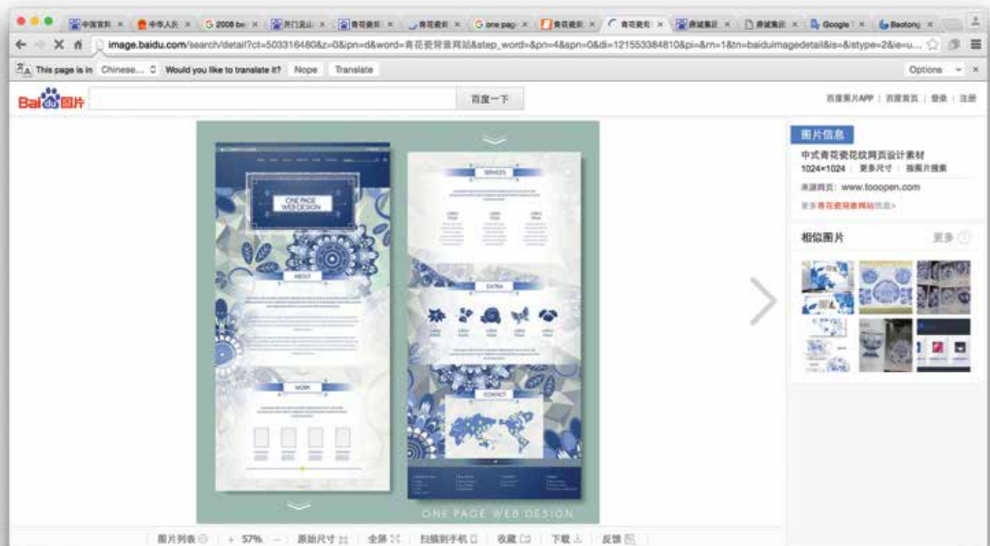
Figure 16. Blue and white porcelain as the unique Chinese element in this interface design.