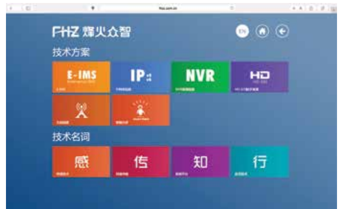
Figure 10. The flat user interface for a technology company’s website.

features the technology company FHZ’s website that is purely flat in design. This design goes very far in its abstract representation without sacrificing readability and usability. It must be noted, though, that the icons on this website interface rely heavily on the text that goes with each icon. Icon and text complement each other. Without either one of the two, their readability and usability would be greatly undermined.