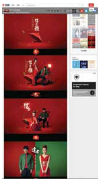
Figure 11. A website for a wedding planner featuring skeuomorphic design.

A second distinct feature of UI (especially logo) design in China is its play on words (Chinese characters), especially those employing the flat design approach. Many Chinese characters, especially in their earliest originating forms, are hieroglyphic, meaning the character is representative of the object it denotes in its form and shape. The design for the logo for